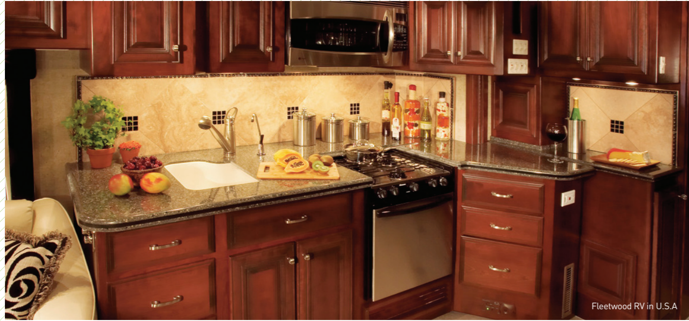
Fleetwood RV in U.S.A