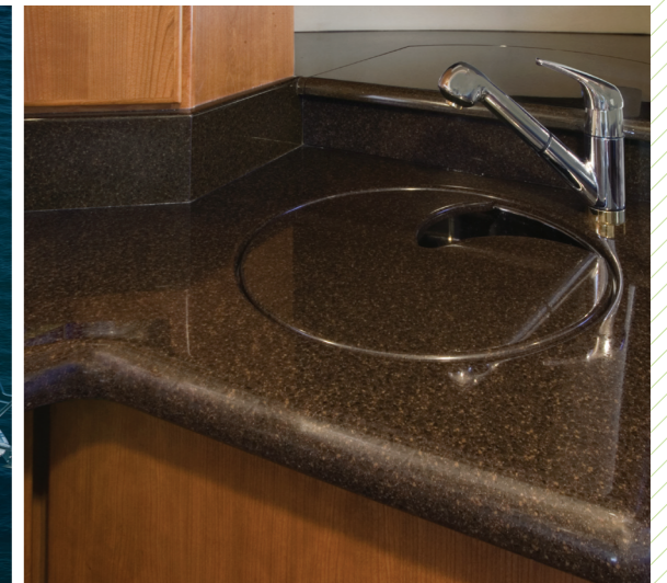
Ovation Yacht in U.S.A