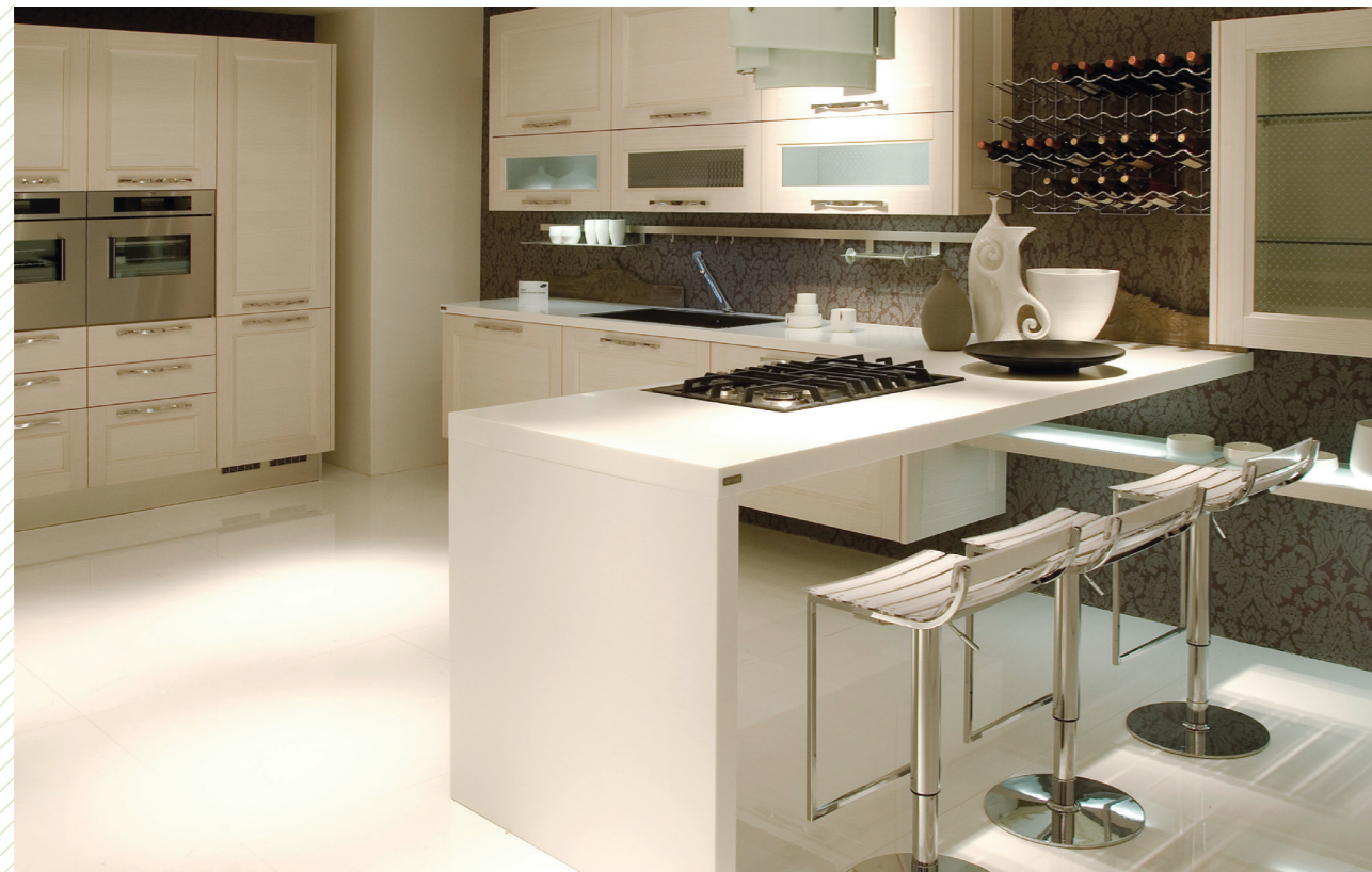
Euro Cucina in Italy