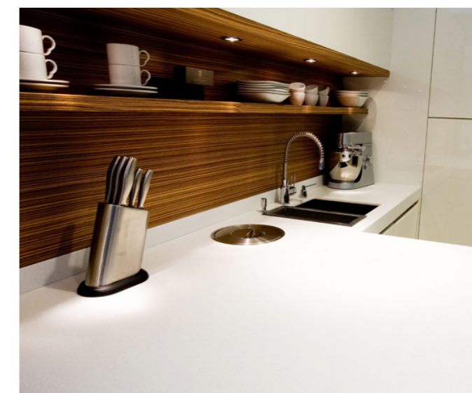
Kitchen Showroom in meil in France