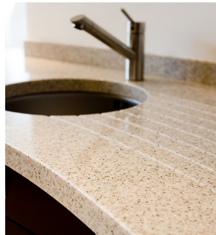
Euro Cucina in Italy