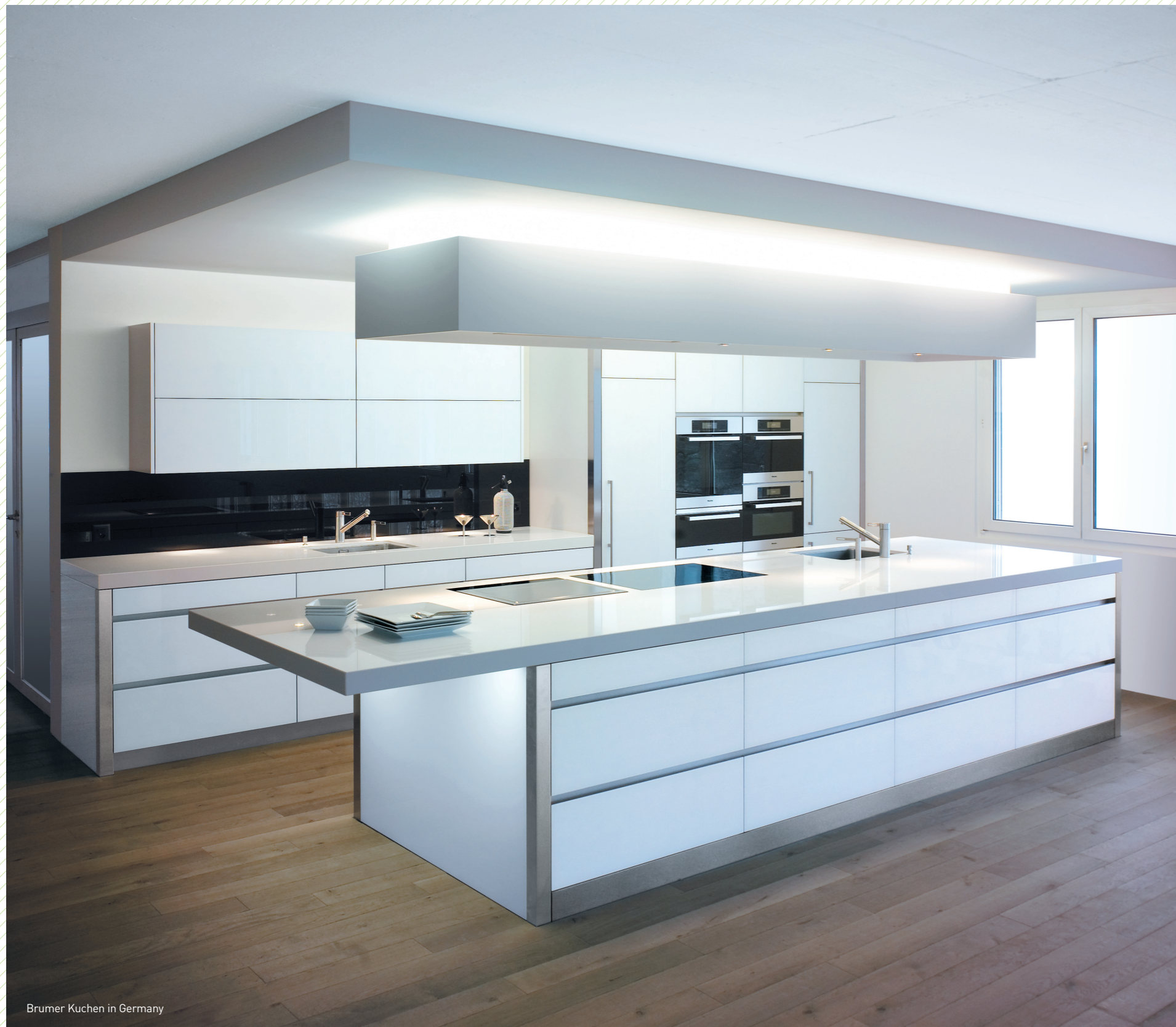
Brumer Kuchen in Germany

For you and your loved ones, we bring special joy to the kitchen area.