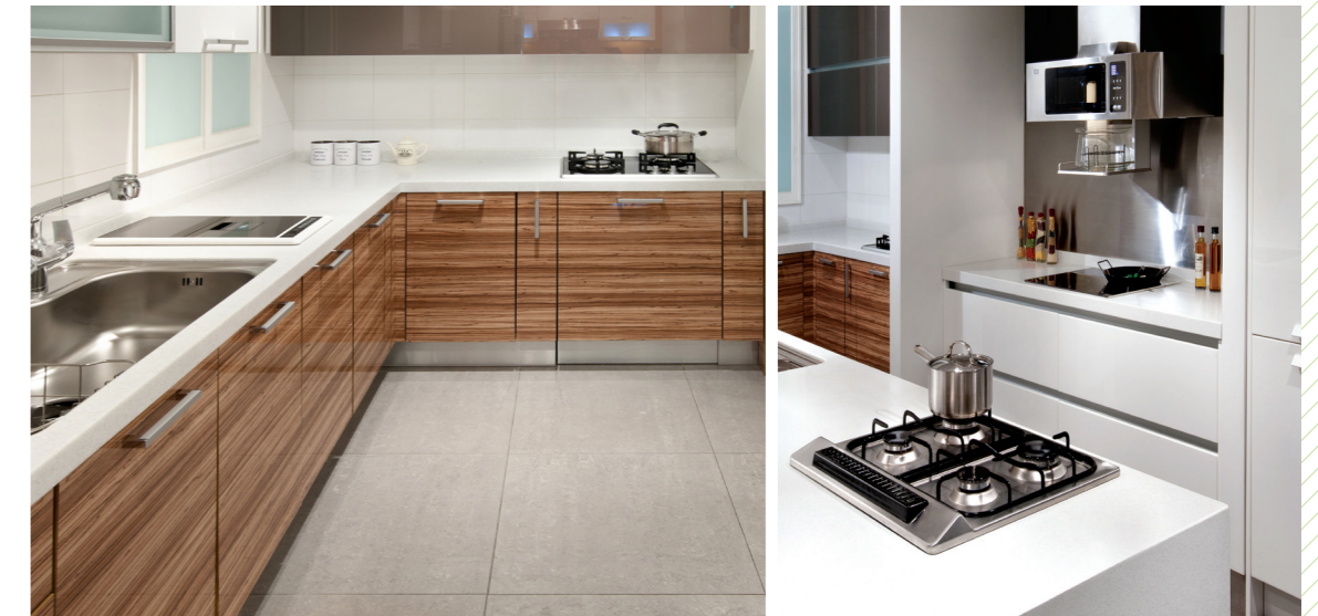
Kusshand in Korea