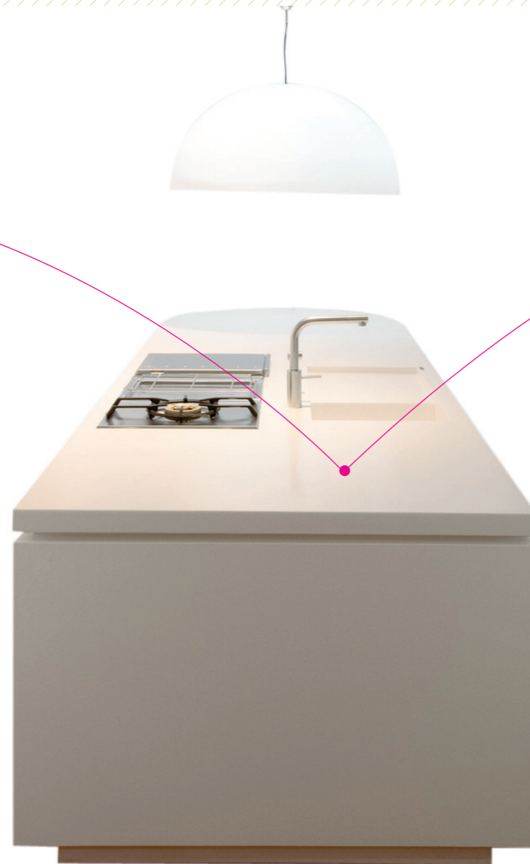
Isaloni 2011 in Italy