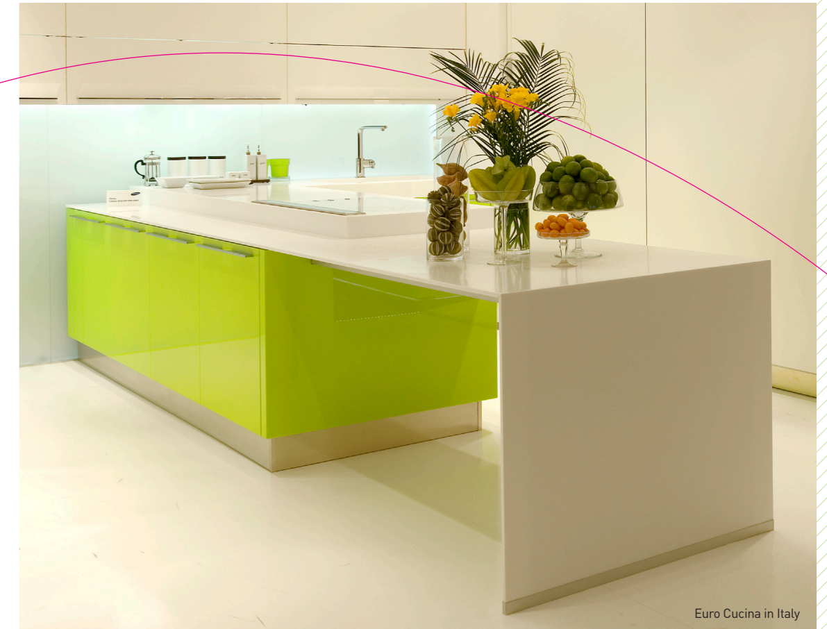
Euro Cucina in Italy

Due to its durability, it is easy to restore in the event there is a crack or damage to material. While cooking in the kitchen, you have probably damaged the tops of your counters with knives and cookware. Staron solid surface can be easily restored to make your kitchen new again.