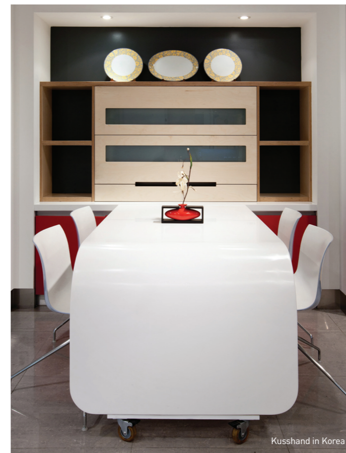
Kusshand in Korea