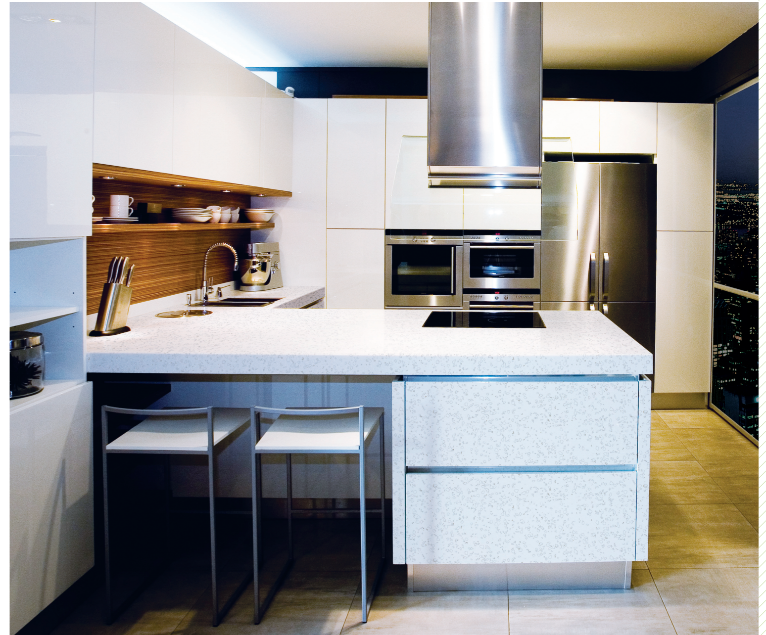
Euro Cucina in Italy