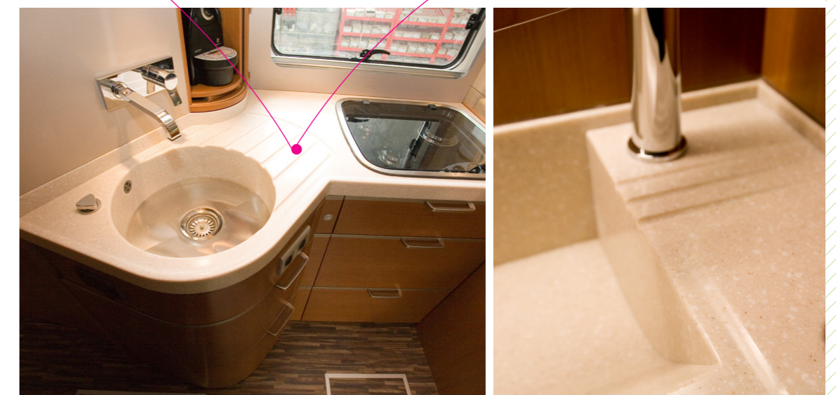
Camping Car in Germany