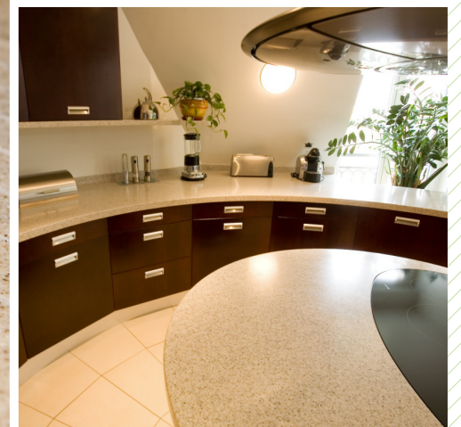
Euro Cucina in Italy