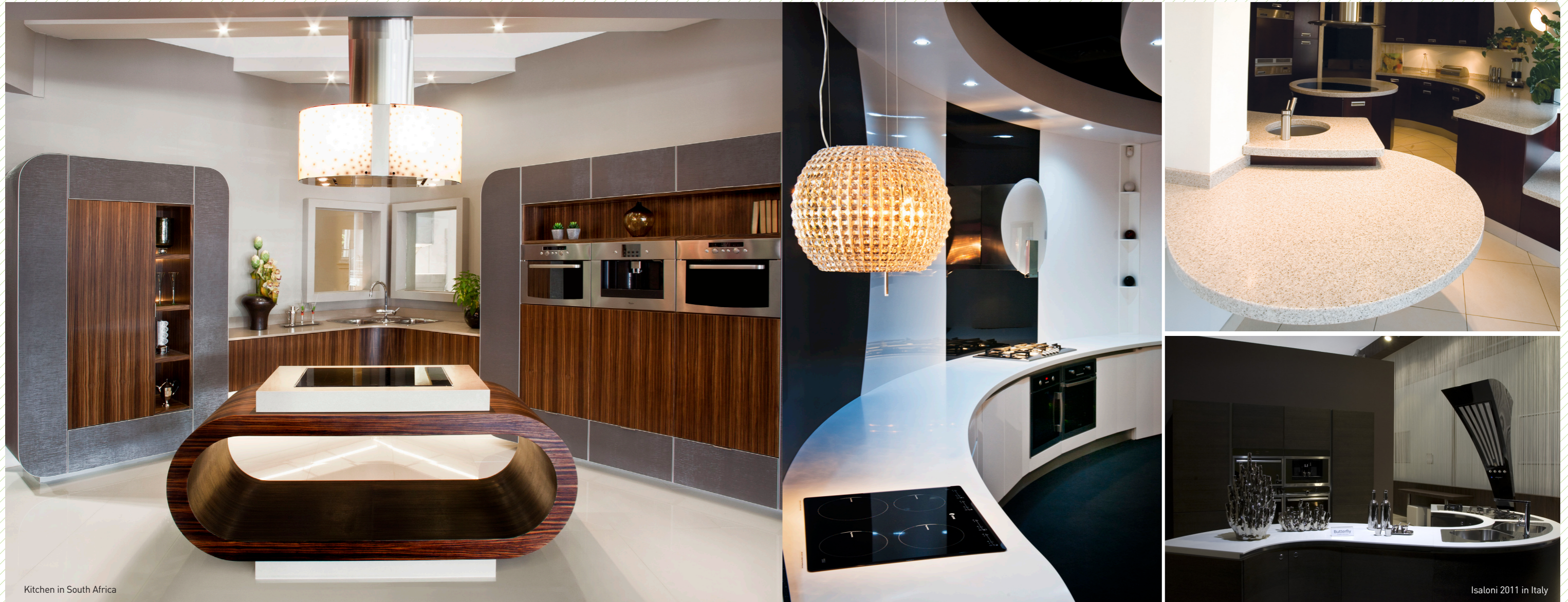
Kitchen in South Africa