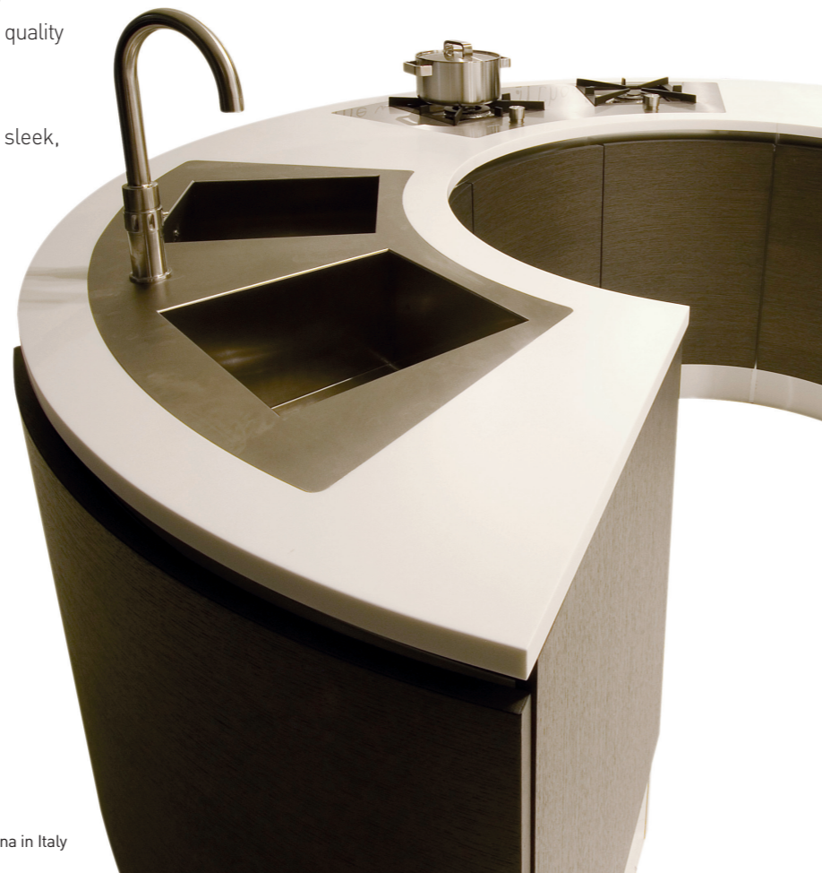
Euro Cucina in Italy

In addition, a variety of curves can be added for a sleek, unique design that meets your needs.