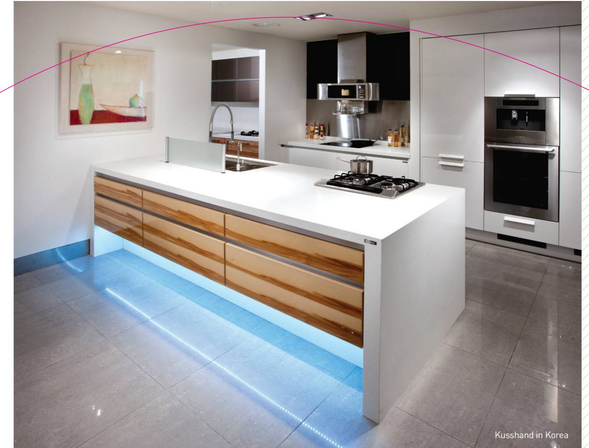
Kusshand in Korea