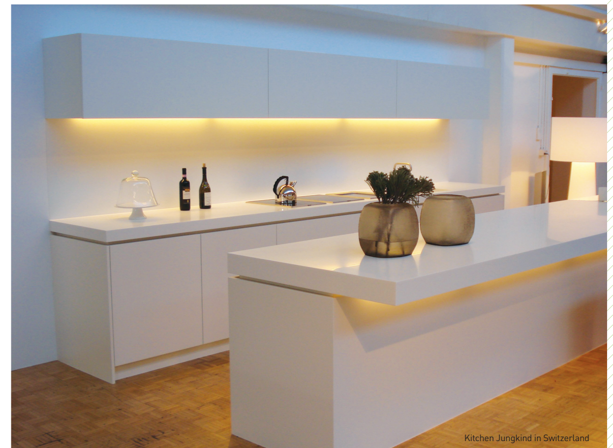
Kitchen Jungkind in Switzerland