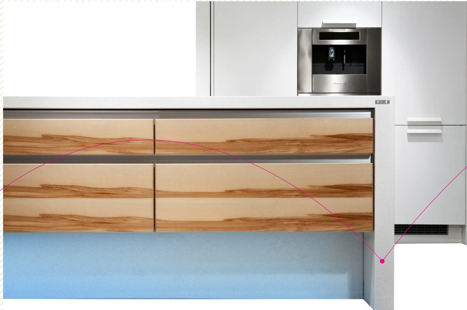
Kusshand in Korea